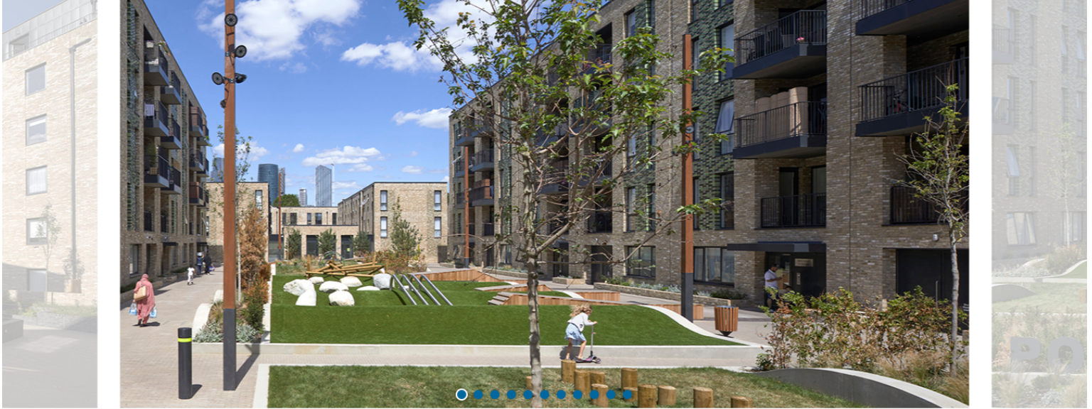
Click image to expand